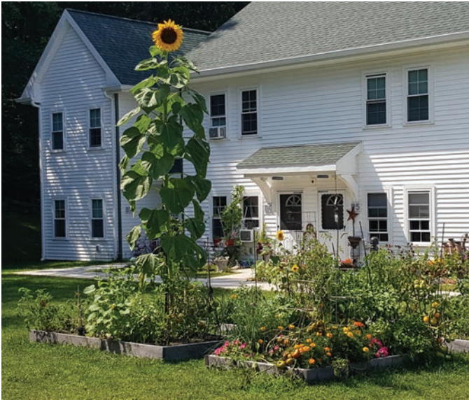
Forest Springs, Great Barrington

Since July 2022, Construct has contributed over $125,000 to provide community members with rental assistance.